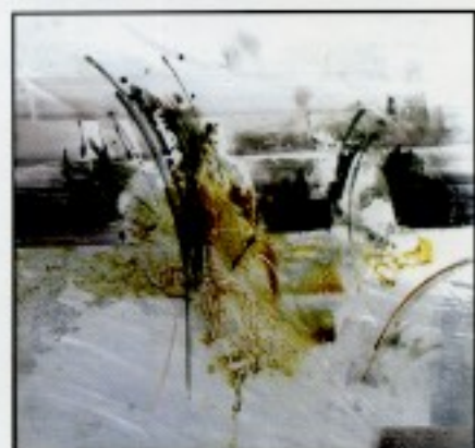
Top: Martinique and detail (middle).