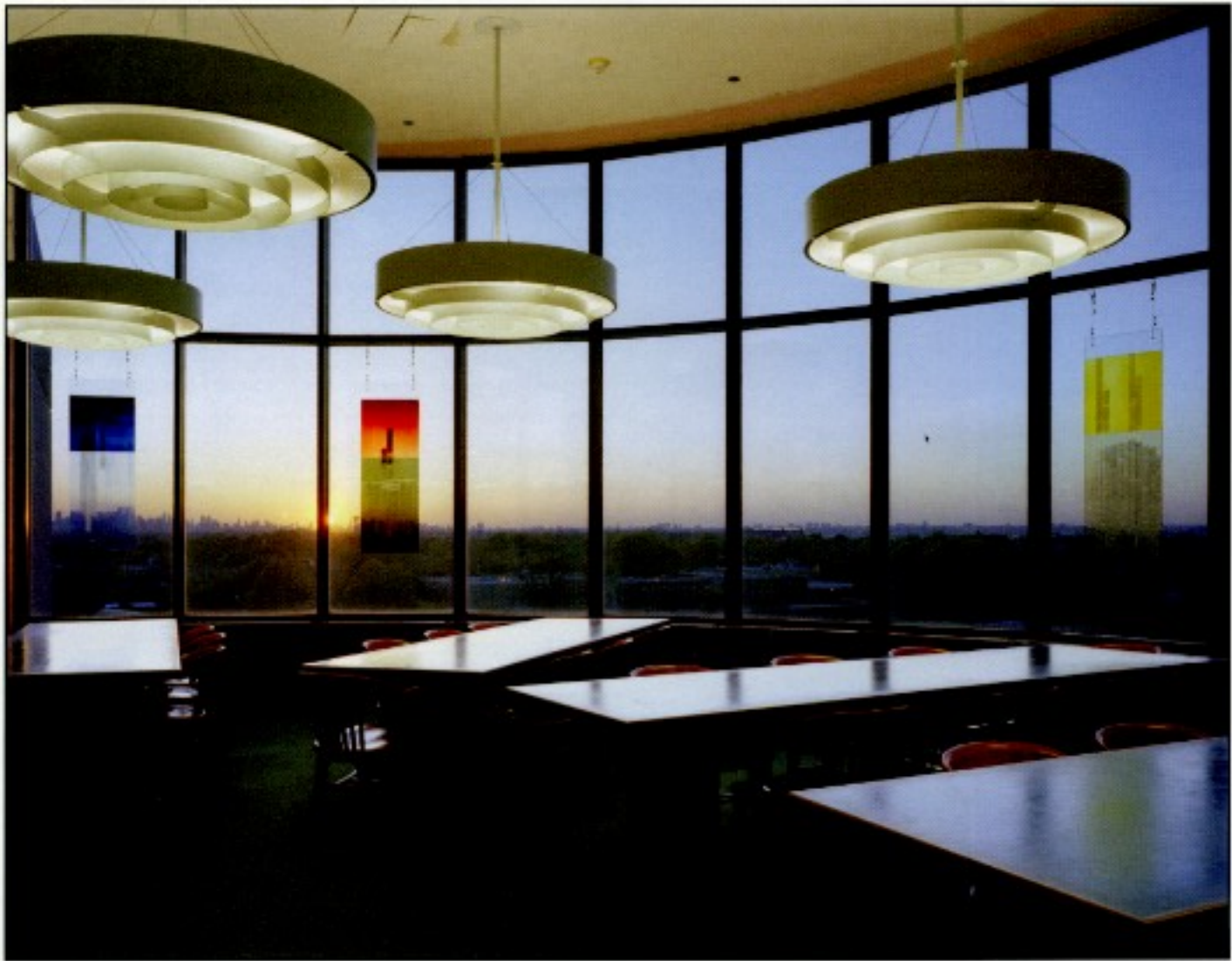
Colors of the Sky