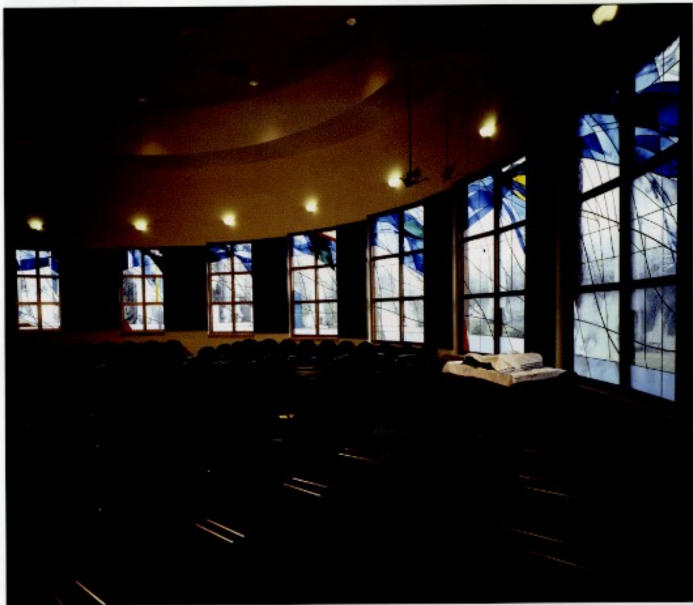
Temple Adath Jeshurun synagogue windows.