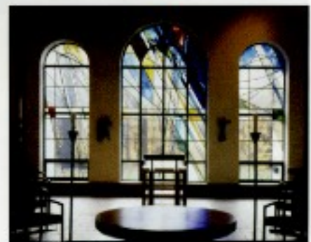
Above: Marian Woods Convent, Resurrection Windows